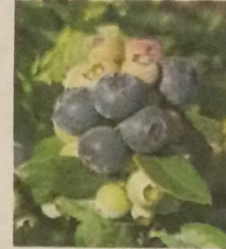
Sunshine Blueberry Vaccinium