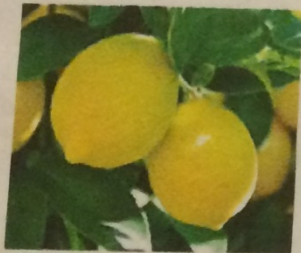
Meyer Lemon Citrus meyeri