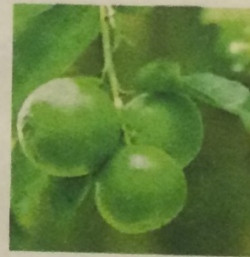
Lime Citrus aurantifolia