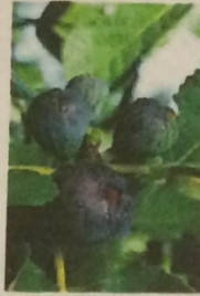
Black Jack Fig Ficus carica