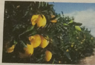
Washington Navel Oranges Citrus sinensis