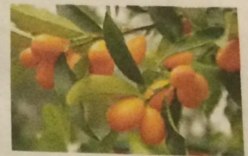
Kumquats Citrus japonica