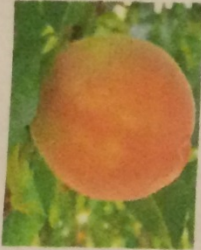
Gleasin Early Elberta Peach Prunus persica